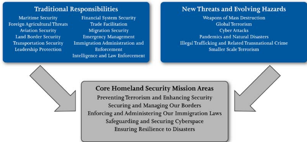
Figure 1. The Evolution of Homeland Security

As noted earlier, although the integrated concept of homeland security arose at the turn of the 21 st century, homeland security traces its roots to concepts that originated with the founding of the Republic. Homeland security describes the intersection of new threats and evolving hazards with traditional governmental and civic responsibilities for civil defense, emergency response, customs, border control, law enforcement, and immigration. Homeland security draws on the rich history, proud traditions, and lessons learned from these historical functions to fulfill new responsibilities that require the engagement of the entire homeland security enterprise and multiple Federal departments and agencies.